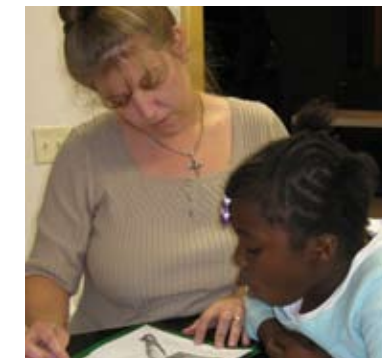
Tutoring after school

Coffee connection - It's strange how just having a place to get a good cup of coffee can really start something. The BLOC Coffee Shop serves many needs of a diverse crowd: students receiving tutoring, businessmen meeting over lunch, local moms stopping in so their kids can play video games, and a place of purpose and pride for the neighbors.